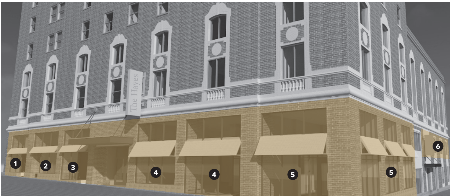
Rehabilitated Historic Hayes Hotel (rendering for conceptual purposes only) / Corner of West Michigan & Hayes Court / Downtown Jackson, MI